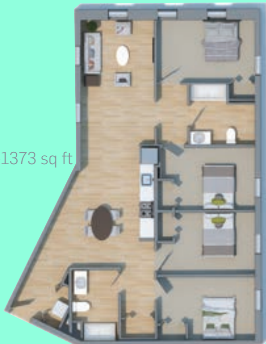
E7 1,353-1373 sq ft