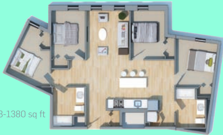
E3 1373-1380 sq ft