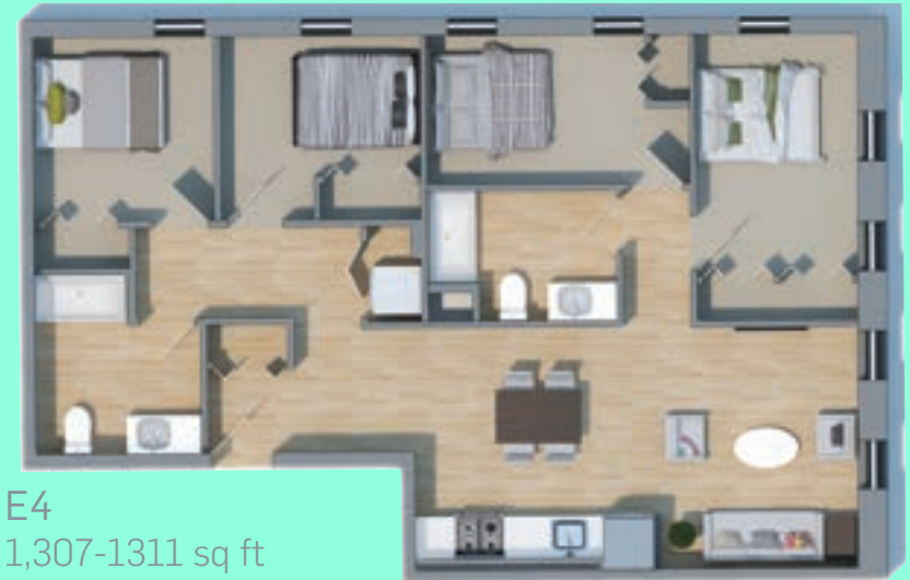
E4 1,307-1311 sq ft