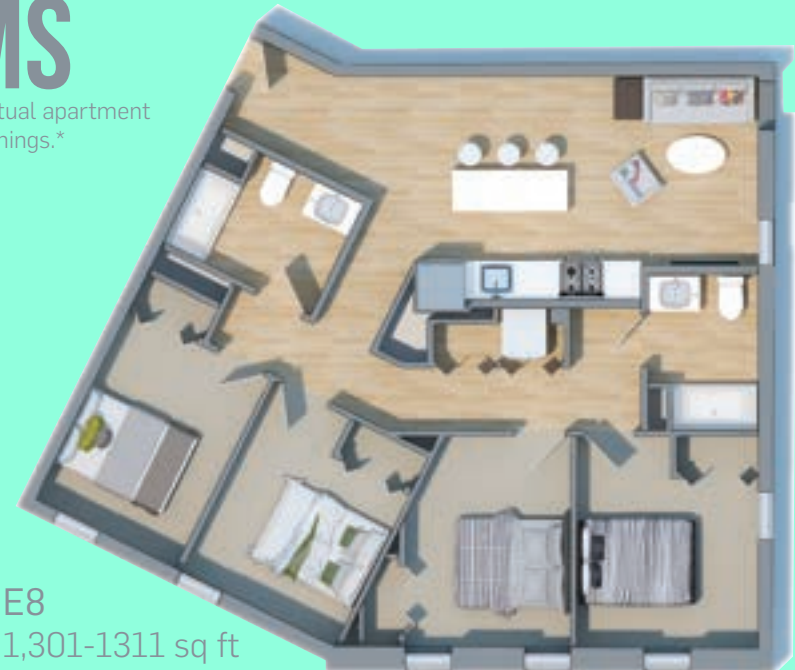
E8 1,301-1311 sq ft

* These floor plans are representations only, the actual apartment may vary in regard to shape, size, colors, and furnishings.*