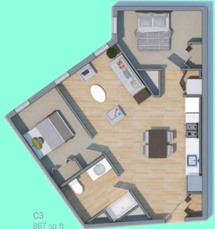
C3 867 sq ft