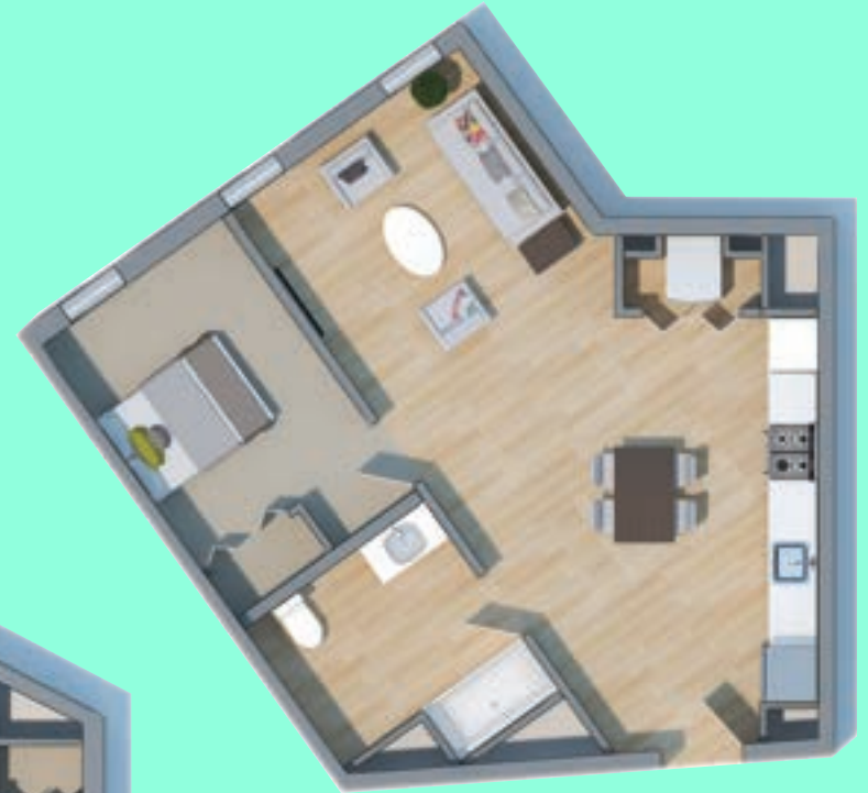
B3 698 sq ft