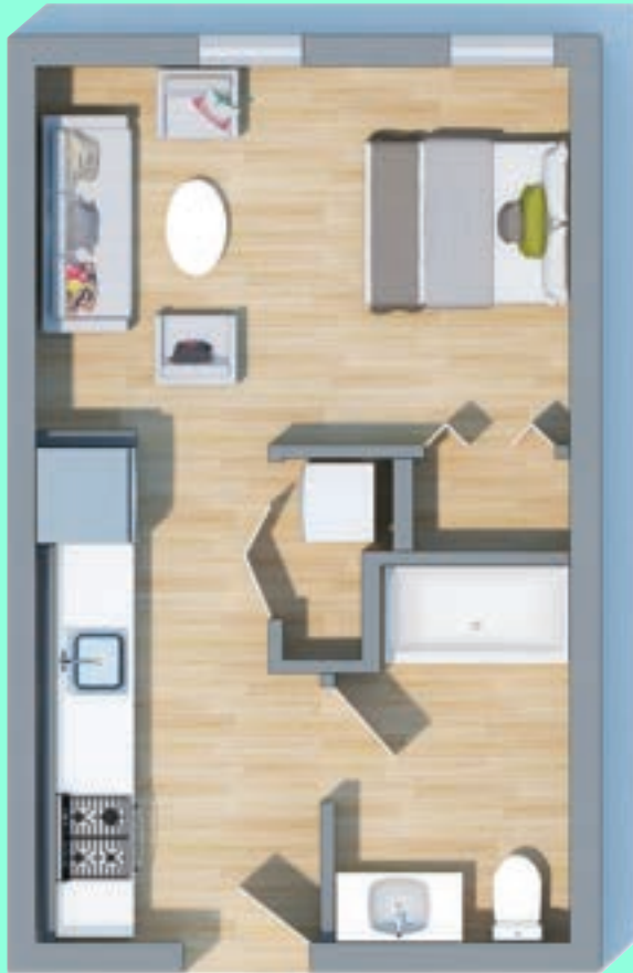
A1 Studio 354 Sq ft

* These floor plans are representations only, the actual apartment may vary in regard to shape, size, colors, and furnishings.*