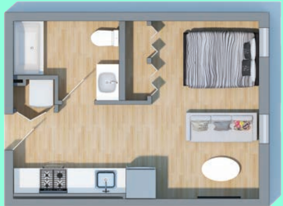
A2 Studio 421 Sq ft